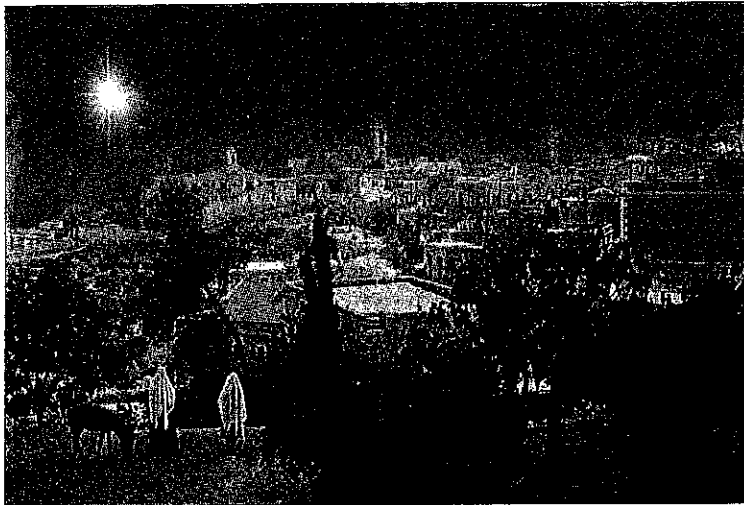
View of Bethlehem, 1898, (with star added)

there that Jesus was born. There was also a special star in the sky over Bethlehem. Wise men from the east saw this star and travelled from a far away country in hopes of seeing the newborn King.