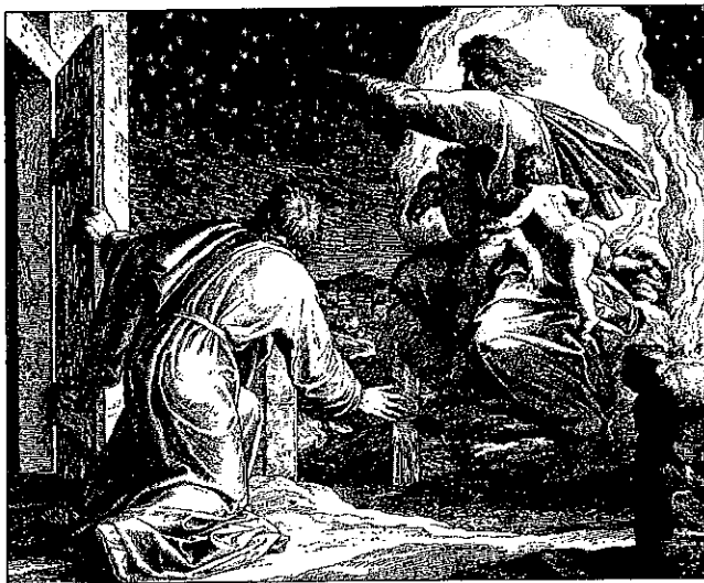
"The Vision of the Lord Directing Abram to Count the Stars", Julius Schnorr von Carolsfeld, 1860

afterwards some angels visited Abraham and told him that his son would be born by the next year. Sarah overheard this and laughed because she was about 90 years old and too old to have a baby. The angel asked Abraham why Sarah laughed because nothing is too hard for God to do. Sarah was frightened and denied laughing, even though she did laugh.