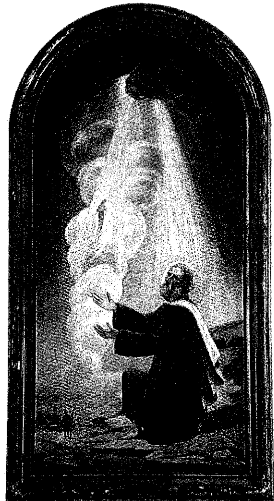
Saint Elijah, Church of Stella Maris, Mt. Carmel, Haifa, Israel

46 Yahweh's hand was on Elijah; and he tucked his cloak into his belt and ran before Ahab to the entrance of Jezreel.