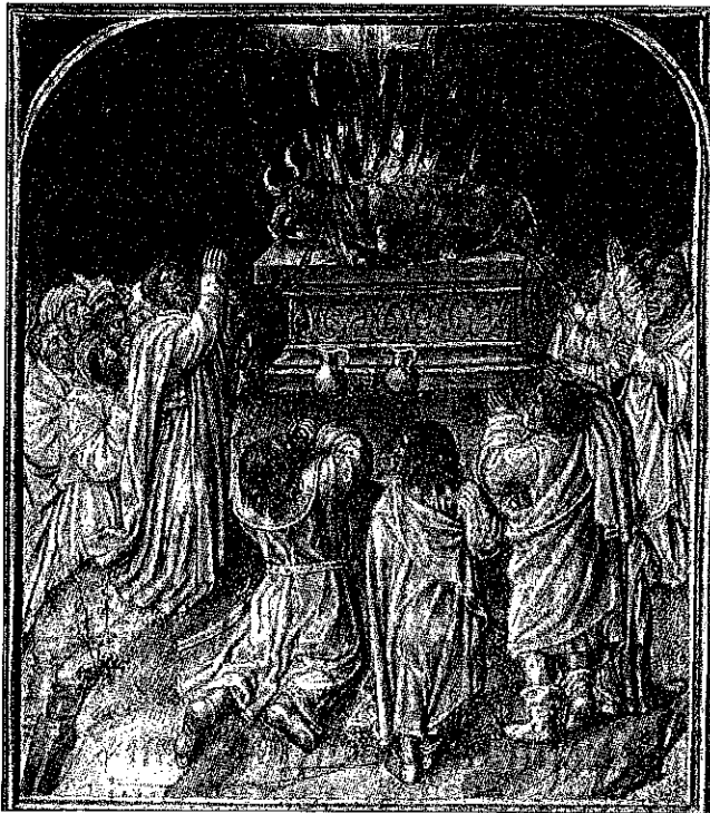
"Elijah Begging for Fire from Heaven" Master of James IV of Scotland, c. 1500

priests of Baal to pray for fire to light the sacrifice; they prayed all morning with no success. Elijah made fun of them, but they cut themselves and added their own blood to the sacrifices and kept praying to the false god Baal with no success again. Then Elijah had his altar covered with water from four large jars to make it even harder to catch fire. He prayed to God to accept the sacrifice, and then fire fell from the sky consuming the water, the sacrifice, and even the stones of the altar. Elijah showed that God was real and Baal was not real by a miracle that only the one true God could do. Elijah ordered the deaths of the prophets of Baal. Then he prayed for rain because there was a drought for many years. Rain began that ended the drought and the famine.