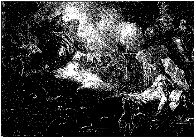
"Dream of Solomon - God promises Solomon Wisdom", Luca Giordano, 1693

Because of this God said that he would tear apart the kingdom of Israel and leave only one tribe to his son for the sake of David his father and for the sake of Jerusalem.