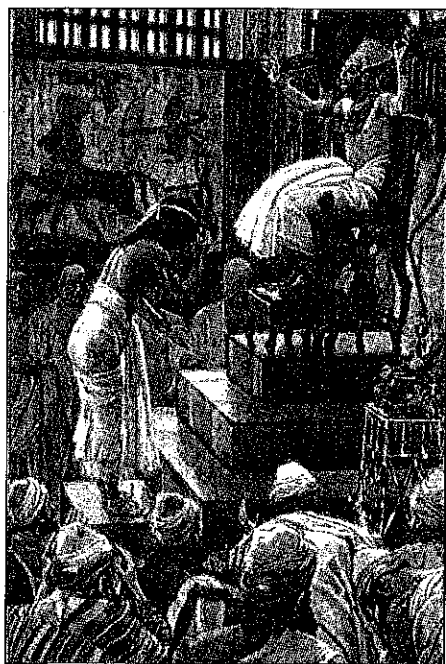
"Joseph and His Brethren Welcomed by Pharaoh" James Tissot, c. 1900

One of Jacob's twelve sons was named Joseph. Jacob loved Joseph very much because he was the son of his old age. He made him a special coat of many colors. It made his brothers so jealous that Jacob was Joseph's favorite son that they sold him into slavery in Egypt. However, this turned out to be for the best because Joseph eventually became a ruler in Egypt. Later Pharaoh, the king of Egypt, had a dream that he didn't understand. Joseph interpreted the dream to mean that there would be a severe famine. Then Joseph told Pharaoh how to help his people. He told him to store up food during the next seven prosperous years so that the people would have food during the following seven years of famine. Back at home, Jacob and his family were suffering from the lack of food. They heard there was food in Egypt so Jacob sent some his sons to Egypt to buy food. Joseph forgave his brothers, and the family eventually all went to live in Egypt with Joseph during the famine. That is how the Israelites came to live in Egypt.