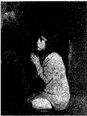
"The Infant Samuel" Sir Joshua Reynolds, 1700s

"Speak, Lord, your servant is listening." Samuel became a great prophet who helped keep Israel's religious heritage of the alive.