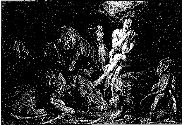
"Daniel in the Lions' Den", Peter Paul Rubens, c. 1615

God allowed Jerusalem to be captured by the king of Babylon. Daniel and his three companions were taken to the palace for training. The king found them to be wise and kept them at his court. Later Daniel was elevated to a high office by King Darius, which made others jealous. Daniel's enemies tricked the king into ordering everyone not to worship any other god except for the king for 30 days, but Daniel did what was right and kept worshipping and praying to God instead. Due to the king's law, Daniel was thrown into a den of lions to be killed. But God protected Daniel from the lions, and he was not harmed.