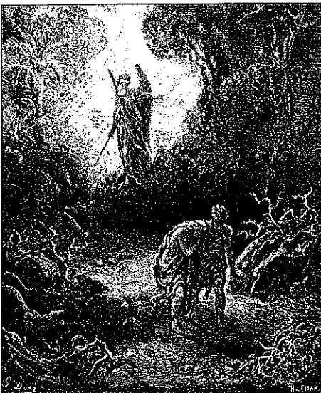
"Adam and Eve Driven out of Eden" Gustave Doré, 1800s

God told Adam and Eve they could eat of all the trees in the Garden of Eden except for one called the "Tree of the Knowledge of Good and Evil." The devil is a fallen angel who disobeyed God and lost Heaven. He hates God and people. He disguised himself as a snake (serpent) and tempted Eve to disobey God. She listened to him and ate the forbidden fruit. She gave some to Adam, and he ate it too. Because of their sin they lost some of God's wonderful blessings for all of mankind. They had to leave the Garden of Eden, and sickness and death entered the world. Their sin is called original sin, which means the first sin.