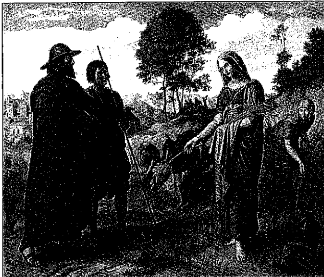
"Ruth in Boaz's Field"

Boaz was a wealthy landowner of Bethlehem. One day he noticed Ruth gathering leftover grain from his fields. It was the custom in those days that the poor could gather the grain left behind after the harvest. Boaz learned that Ruth had a hard life, and he invited her to eat with him and his workers. Boaz later married Ruth. They had a son named Obed who became the father of Jesse and grandfather of King David, an ancestor of Jesus.