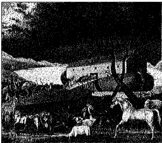
"Noah's Ark", Edward Hicks, 1846

After a time sin in the world increased so much that almost everyone was wicked except for just a few people. Things got so bad that God decided to destroy all the people on the earth with a great flood, except for Noah and his family. God told Noah to build an ark and put a pair of each kind of animal in the ark along with his wife and children and their families. He told him to also bring food. In this way God saved Noah and his family from the great flood because Noah was a righteous man. After the flood, God made a rainbow in the sky. God said that the rainbow would be a sign that he would never destroy the whole world with a flood ever again. God blessed Noah and his family and told them to be fruitful and multiply.