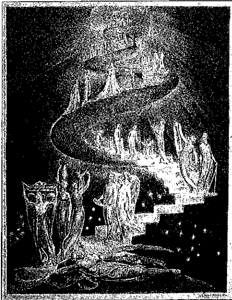
"Jacob's Ladder" by William Blake c. 1800, British Museum, London

When Isaac was about 40 years old, he married Rebekah. They had twin boys named Esau and Jacob. Esau was born first, and in those days that meant because he was the oldest he would inherit the birthright from his father. When Isaac got old and blind, Rebekah and Jacob tricked Isaac into blessing Jacob with the inheritance of being the firstborn son. Later Jacob dreamed about a stairway going to Heaven with angels going up and down. God told Jacob that he would have many descendants, and that he would give him a land for him and his offspring. Jacob is also called Israel. He became the father of twelve sons from whom descended the twelve tribes of Israel. This is how the Jewish nation began.