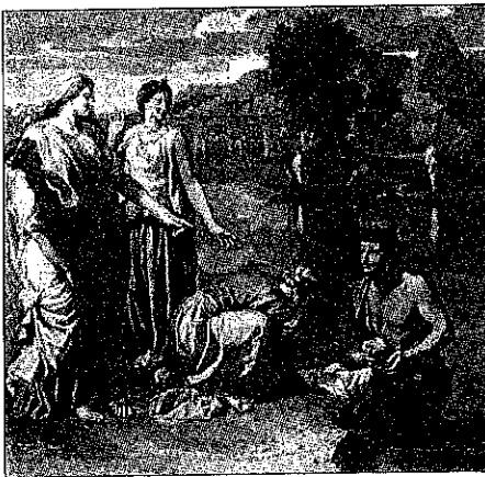
"Moses rescued from the Nile" Nicolas Poussin, 1638

mark the doors of their houses with the blood of a lamb to be a sign for the plague to pass over their houses. When Pharaoh's son was killed, he finally let the Israelites go. During the Passover celebration each year Jews remember how God rescued them from slavery in Egypt, how quickly they left, and how there wasn't even enough time to let the bread dough rise before baking it. That is why only unleavened bread is eaten for the Feast of the Unleavened Bread.