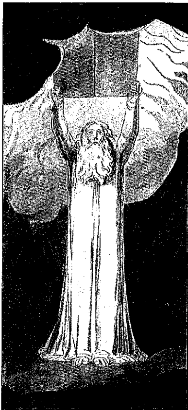
"Moses Receiving the Law" William Blake, 1780

After the 10 th plague, Moses was able to lead his people out of Egypt. This is called "The Exodus". After they left Pharaoh changed his mind about letting the Israelites go and took his army to try to recapture them. When Moses and the people came to the Red Sea, God worked a miracle; God parted the sea so that the Israelites could walk through and escape the Egyptians. When the Egyptians followed them, the sea fell back on them. The Israelites escaped Pharaoh and wandered in the desert for 40 years. During that time Moses went up Mt. Sinai where God gave him the 10 commandments inscribed on two stone tablets. The first three commandments are about how to love God above all things, and the last seven commandments are about how to love other people.