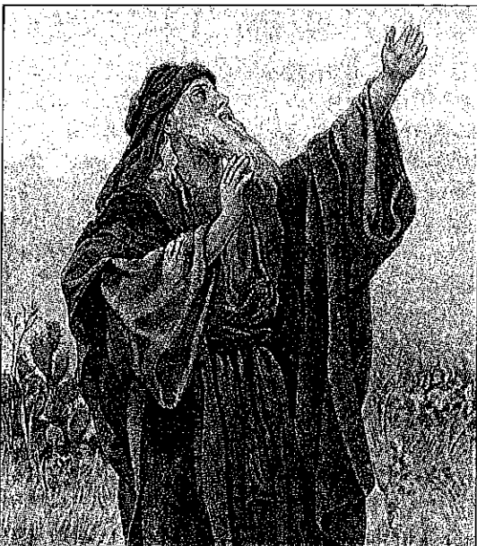
"The Prophet Isaiah", Biblecard illustration, Providence Lithograph Company (c. 1904)

his death long before Jesus was born. The book of Isaiah is quoted many times in the New Testament about how the Messiah would suffer, and that he would die to save many from their sins. He also foretold that the Messiah would be buried in a rich man's tomb and would be a light to the Gentiles.